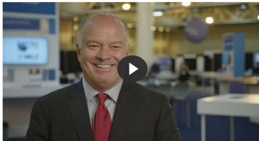
Take a look at this InvestmentNews video to learn how EIOC is preparing young talent for the wealth and asset management industry